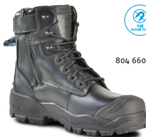
LONGREACH ZIP 6" Composite Zip Sided Safety Boot

Sizes UK 3-14 (Half Sizes 7½-10½) Colour Wheat Nubuck Leather 804 88015 Sole PU/Rubber *Does not include D30 Heel Insert.