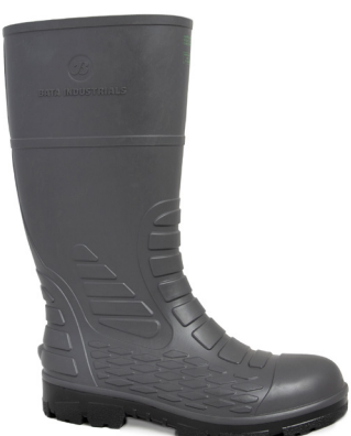
JOBMASTER 5 892-26080 Premium 400mm PVC Gumboot

Standard Certification AS 2210.3:2019 SB FO AN SR E ASTM F2413-18 EH