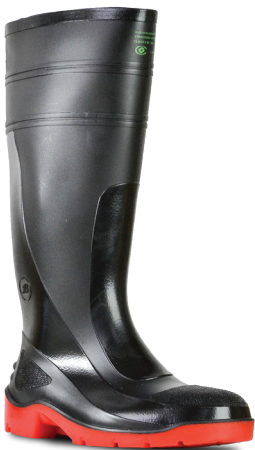
UTILITY 400mm PVC Safety Gumboot

Standard Certification AS 2210.5:2019 OB FO E SR AN ASTM F2892-18 EH