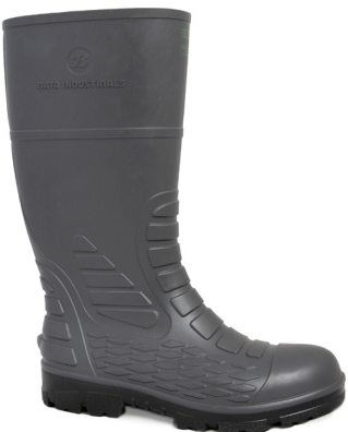
JOBMASTER 5 892-26090 Premium 400mm PVC Safety Gumboot

Standard Certification AS 2210.3:2019 SB FO P E AN SR ASTM F2413-18 EH PR