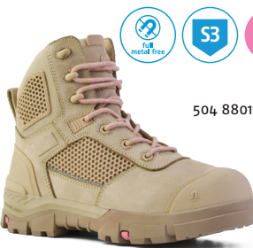
AVENGER Sand Zip Sided Safety Boot

Sizes UK 3-14 Colour Black Full Grain Leather 804 66031 Sole PU/Rubber