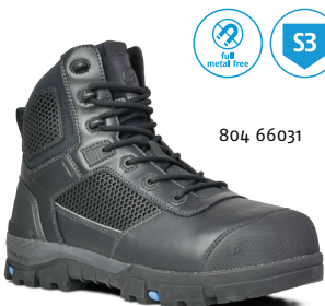
AVENGER Black Zip Sided Safety Boot

Sizes UK 3-14 Colour Wheat Nubuck Leather 804 88015 Sole PU/Rubber