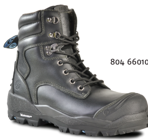
LONGREACH 6" Lace Up Safety Boot

Sizes UK 3-14 (Half Sizes 7½-10½) Colour Wheat Nubuck Leather 804 88009 Sole PU/Rubber