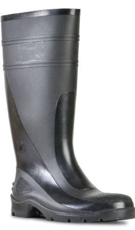
UTILITY 400mm PVC Gumboot

Sizes UK 5-12 Colour Black/Black Sole PVC