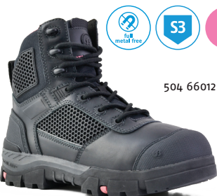
AVENGER Sand Zip Sided Safety Boot

Sizes US 5-11 (Ladies) Colour Sand Nubuck Leather 504 88011 Sole PU/Rubber