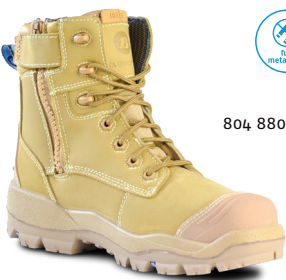
LONGREACH ZIP 6" Composite Zip Sided Safety Boot

Sizes US 5-11 (Ladies) Colour Black Full Grain Leather 504 66012 Sole PU/Rubber