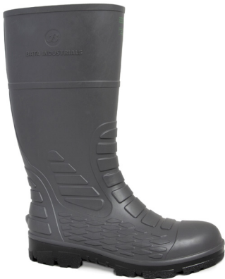
JOBMASTER 5 892-26092 Premium 400mm PVC Safety Gumboot with Penetration Resistant Midsole

Standard Certification AS 2210.3:2019 SB P M E AN SR FO ASTM F2413-18 EH PR MT