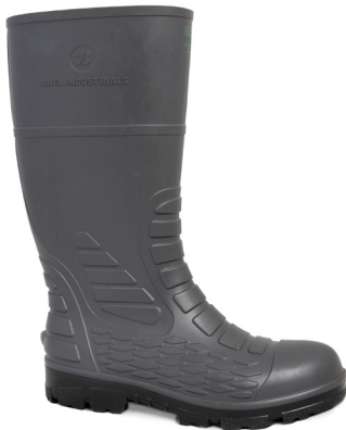
JOBMASTER 5 892-26094 Premium 400mm PVC Safety Gumboot with Penetration Resistant Midsole & Metatarsal Protection

Sizes UK 4-15 Colour Grey/Black Sole PVC NITRILE