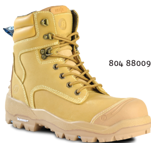
LONGREACH 6" Lace Up Safety Boot

Sizes UK 3-14 (Half Sizes 7½-10½) Colour Black Full Grain Leather 804 66029 Sole PU/Rubber *Does not include D30 Heel Insert.