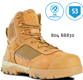
AVENGER Wheat Zip Sided Safety Boot

Sizes UK 3-14 Colour Wheat Nubuck Leather 804 88015 Sole PU/Rubber